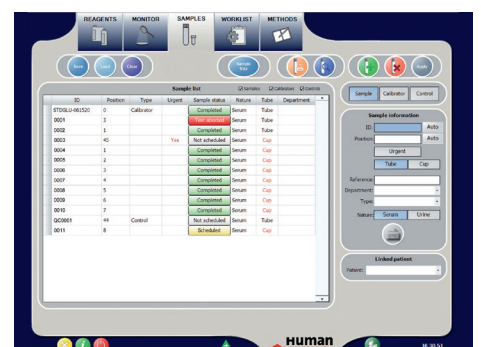
User Interface: Samples